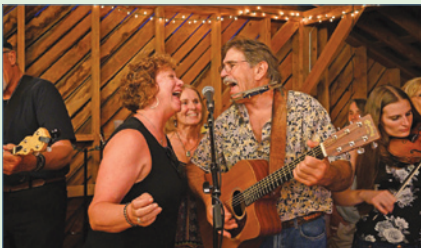
The band Gnarly Fingers plays at the celebration of MountainTrue's merger with the Hiwassee River Watershed Coalition on August 17.

On July 1, MountainTrue welcomed more than 500 new members when we merged with the Hiwassee River Watershed Coalition (HRWC)!