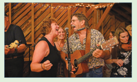
The band Gnarly Fingers plays at the celebration of MountainTrue's merger with the Hiwassee River Watershed Coalition on August 17.

On July 1, MountainTrue welcomed more than 500 new members when we merged with the Hiwassee River Watershed Coalition (HRWC)!