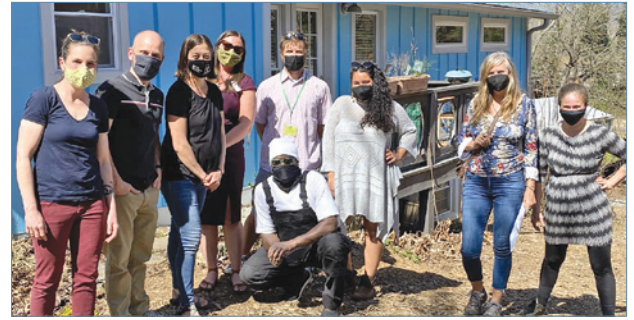
Solarize Asheville-Buncombe Steering Committee members at a mini-press event on April 5.

The campaign has also attained funding to help more families afford solar and is crowdfunding for donations to make solar accessible to even more people in our community.