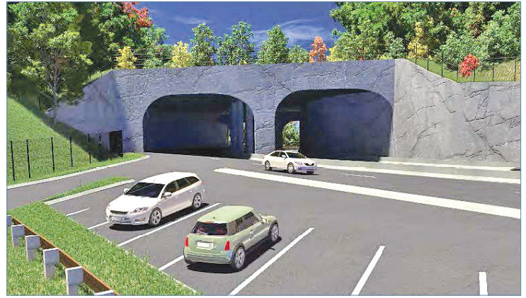
A visualization of the new land bridge overpass above the Corridor K segment near Stecoah Gap.

Thank you to all of our members and our advocacy partner, WaysSouth, for leading the way to achieve this outcome. We're also grateful to NCDOT for listening to environmental concerns and reducing the overall footprint of the project.