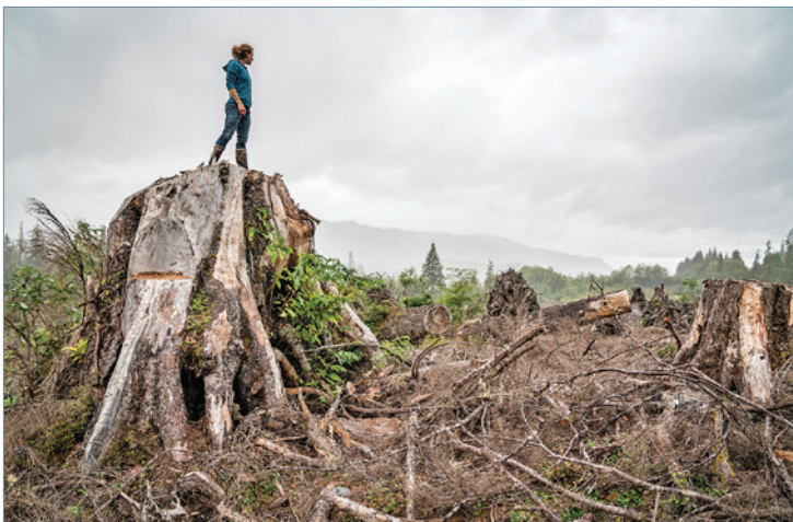
A still from Understory, a film starring three women activists featured at this year's No Man's Land Film Festival.

Read the full article at mountaintrue.org/rethinking-smart-growth .