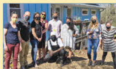
Steering Committee members.